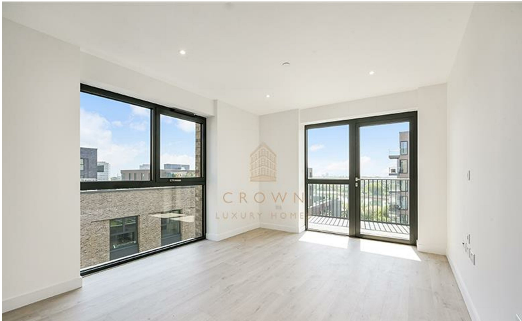
Flat 38 Scarlet Court Damsel Grove, London, N4 2UG £2,350